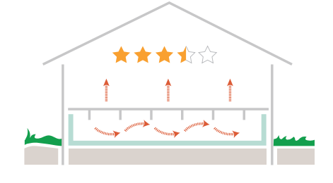
YOUR CRAWL SPACE ENCAPSULATED